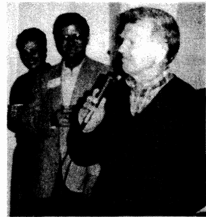
Governor George Nigh