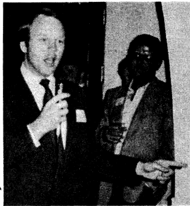
U.S. Senator Don Nickles '71