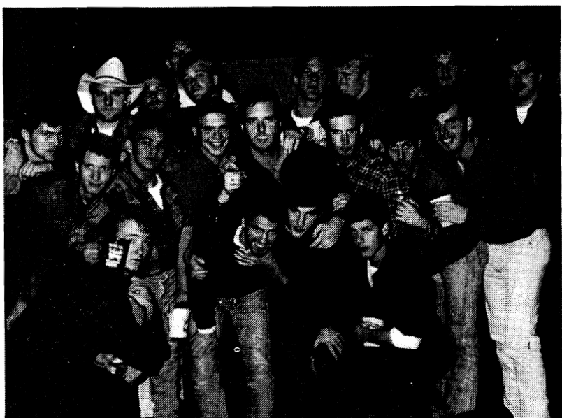
FOOT-STOMPING GOOD TIME: As you can see, the brothers obviously had a great time at our annual Barn Dance last fall.

These occasions provided both the membership and the pledge class with the opportunity to enjoy the brotherhood that has meant so much to us as Betas.