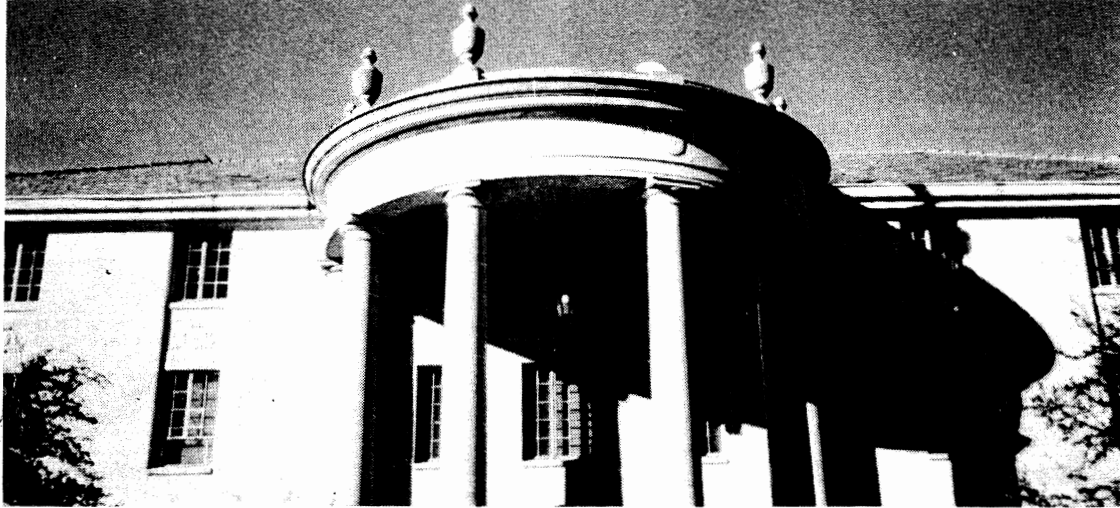
The chapter house at 800 Chautauqua stands as tall as ever despite our fallen pillar cap.

The following is an article which appeared in the Daily Oklahoman . It describes the situation concerning hazing allegations against the Sigma Alpha Epsilon fraternity and the reaction of the greek system at the University of Oklahoma. Having encountered problems with hazing ourselves three years ago, the active members of Beta Theta Pi are particularly sensitive to this issue. We in no way condone the actions which the members of SAE are accused of instigating. Great strides have been taken by the chapter to rid ourselves of the stigma we have borne as the "hazing fraternity." Our new pledge program has been designed as a constructive learning experience and hazing in any shape or form no longer exists at the Gamma Phi chapter. We thank you for your continued support and assure you that the Gamma Phi chapter of Beta Theta Pi will continue its tradition of excellence for the next 83 years.