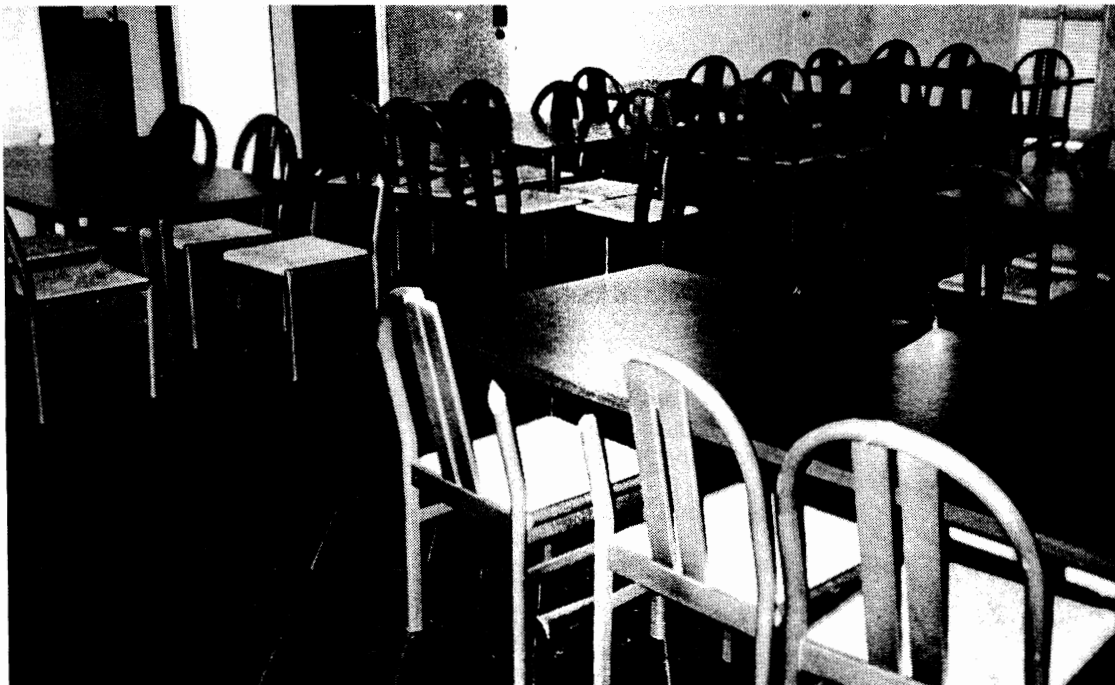
Thanks to Beta Moms & the new Norman Beta Club, $7,000 was donated to purchase new tables and chairs.