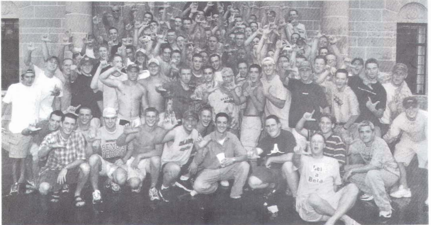
Bid Day 1999 found 45 new pledges posing on the front steps with members at the conclusion of fall rush.