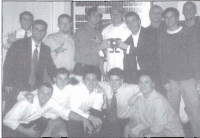
New initiates and upperclassmen from Norman celebrate initiation January 18, 2002.