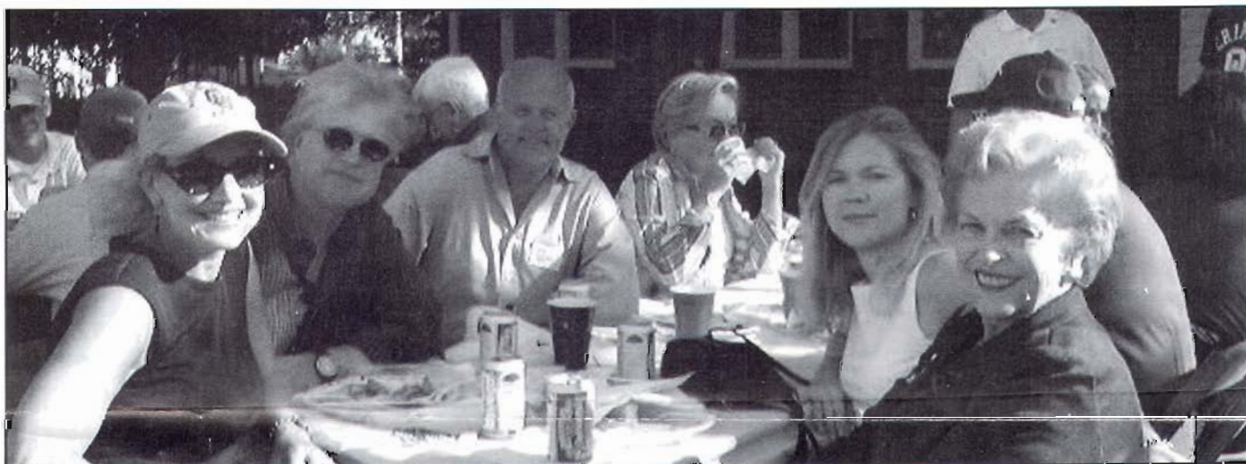
Beta Alumni Beer and BBQ Reunion 2001