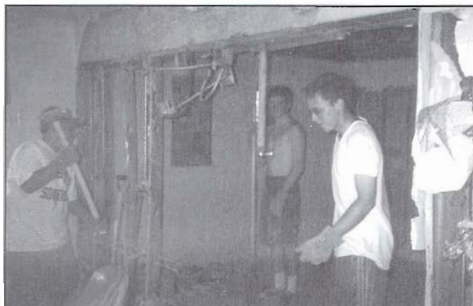
Early stages of construction of new chapter house bathrooms last summer involved gutting and completely replacing all fixtures and finishes.

If you have not yet joined in this year's Donors Campaign, please do so now. Our Fraternity is providing a good home for fine young men who will be future leaders in Oklahoma and the rest of the nation. Contributions from our alumni demonstrate to these young men not