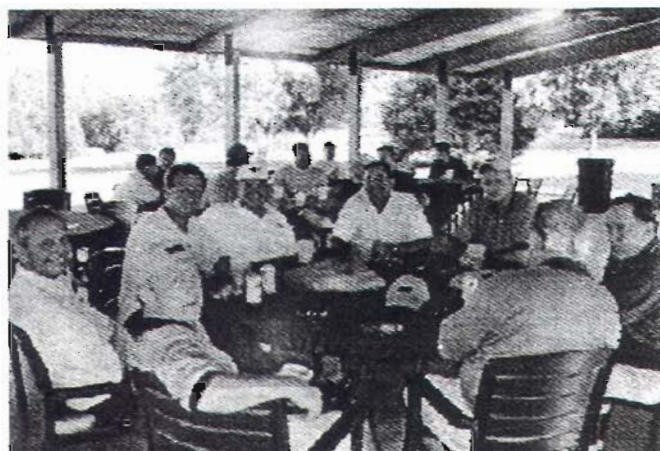
"Brews and BBQ After the Alumni Golf Tourney"