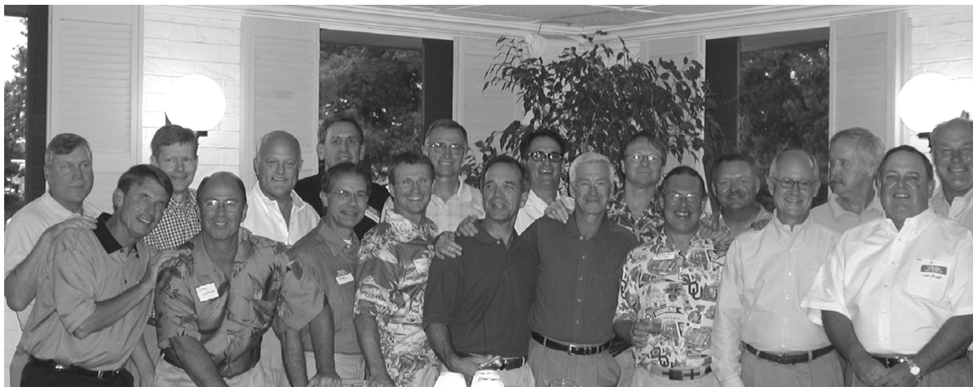
Members of the Fall 1967 Pledge Class met at Legends Times Two in Norman on July 24th.