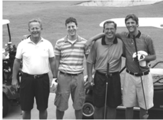
7A: Baptist, Baptist, Holliday, Holliday