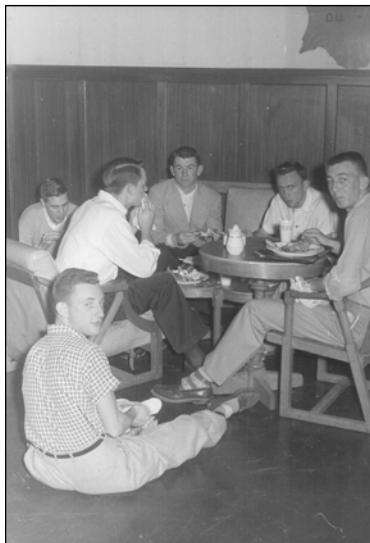
The alumnus providing these snapshots says that they are from work week and/or rush week in the early 1950s. See anybody you know?