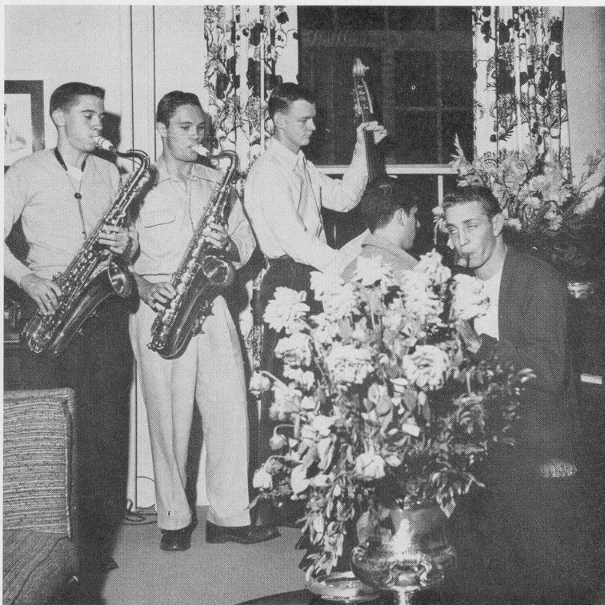
The Beta combo gets together for a little practice before the next party.