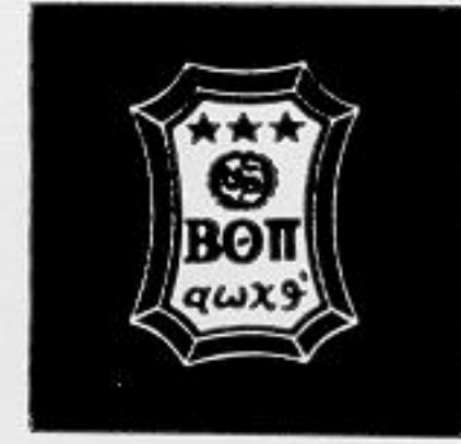
BETA THETA PI