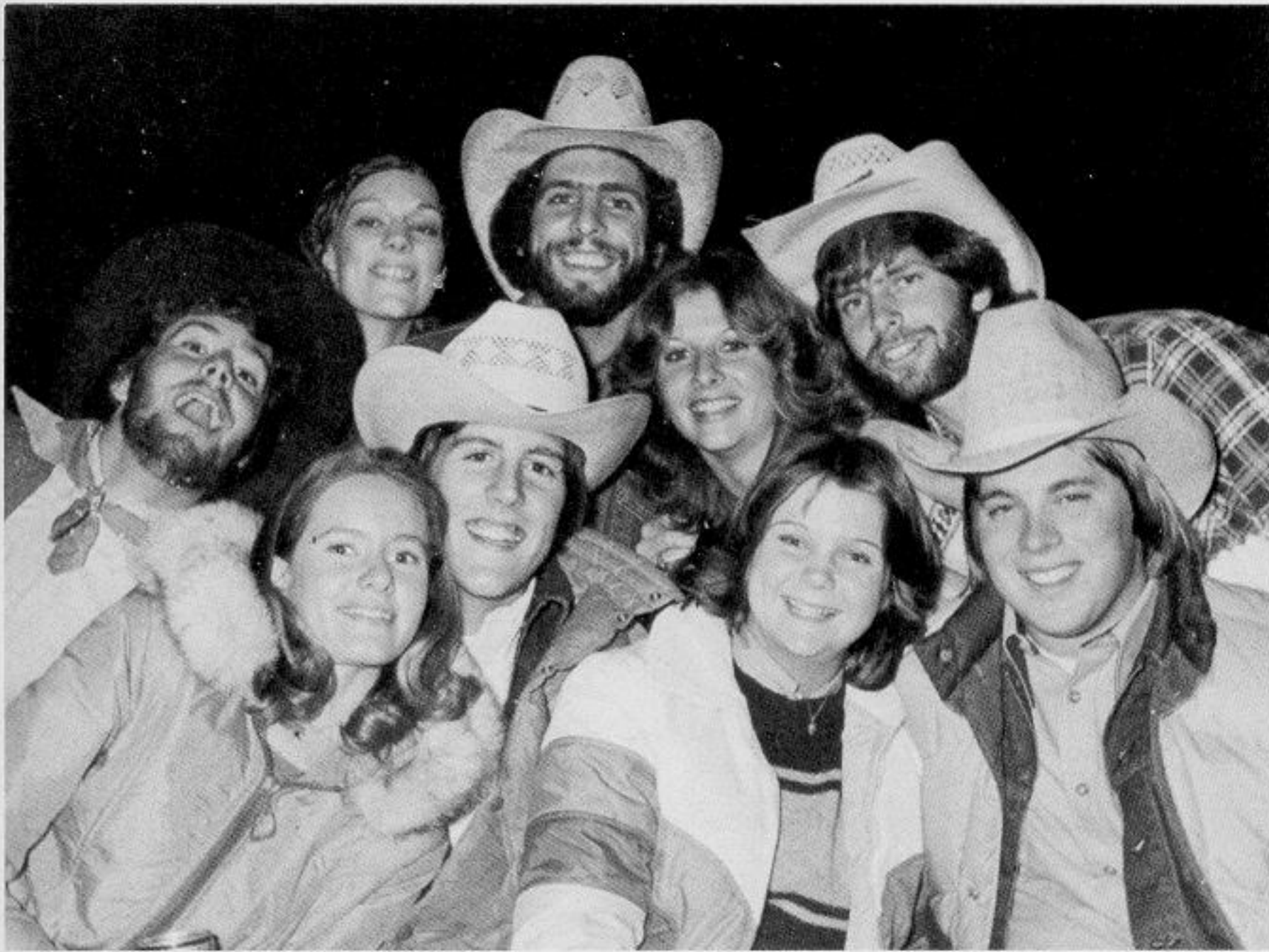
Left: Betas and their dates gather for a picture at the Beta Barn-dance.