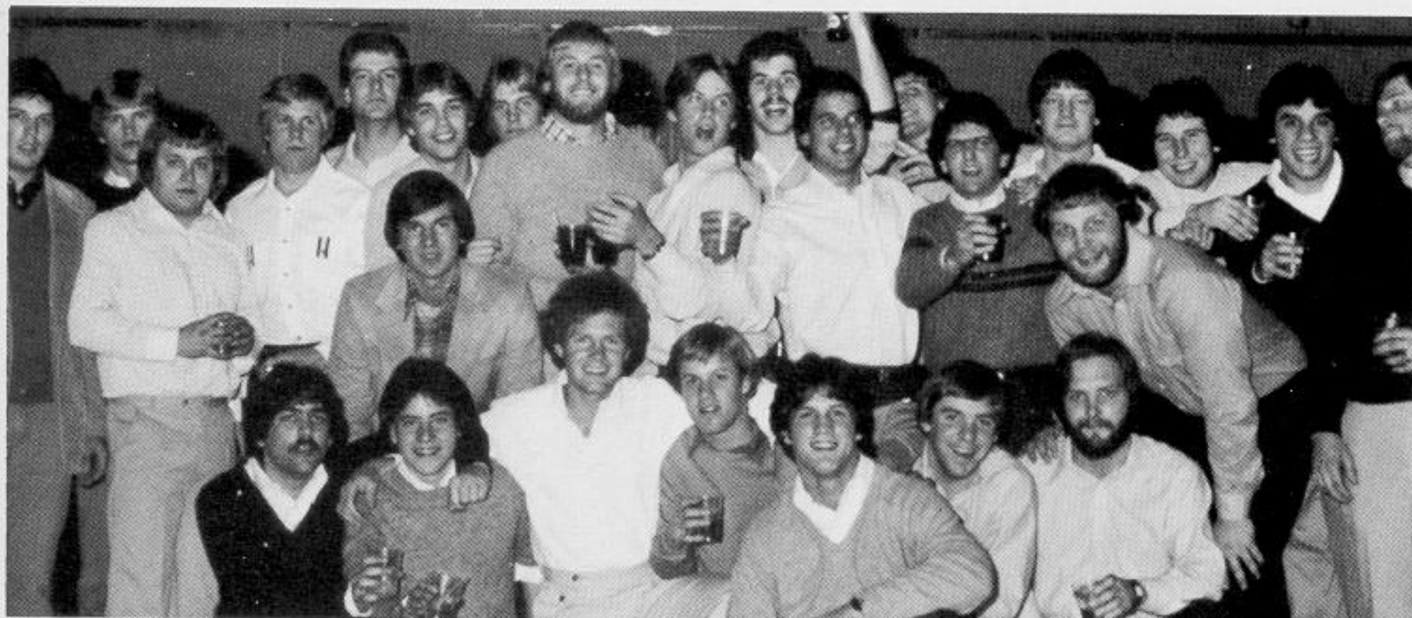
Betas gather in the Myriad's Great Hall for a massive group picture.