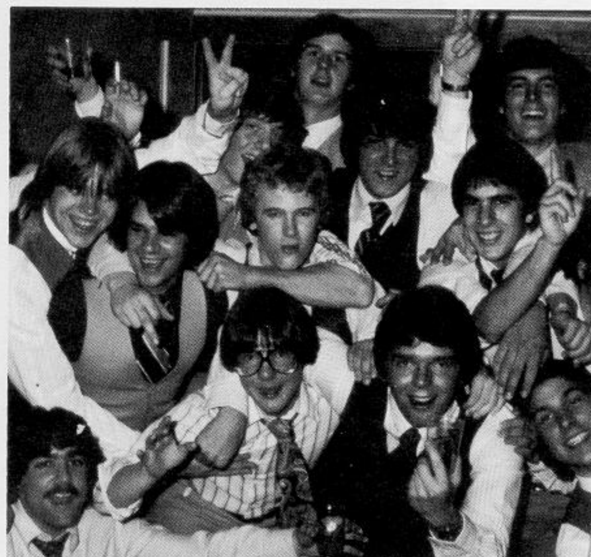
These Betas try to see how many guys they can crowd in a corner at the Valentine's Party.

Imagination and individuality continued to thrive at 800 Chautauqua. The men of Beta Theta Pi combined their diverse interests of today with their rich traditions of the past to strengthen their Gamma Phi chapter.