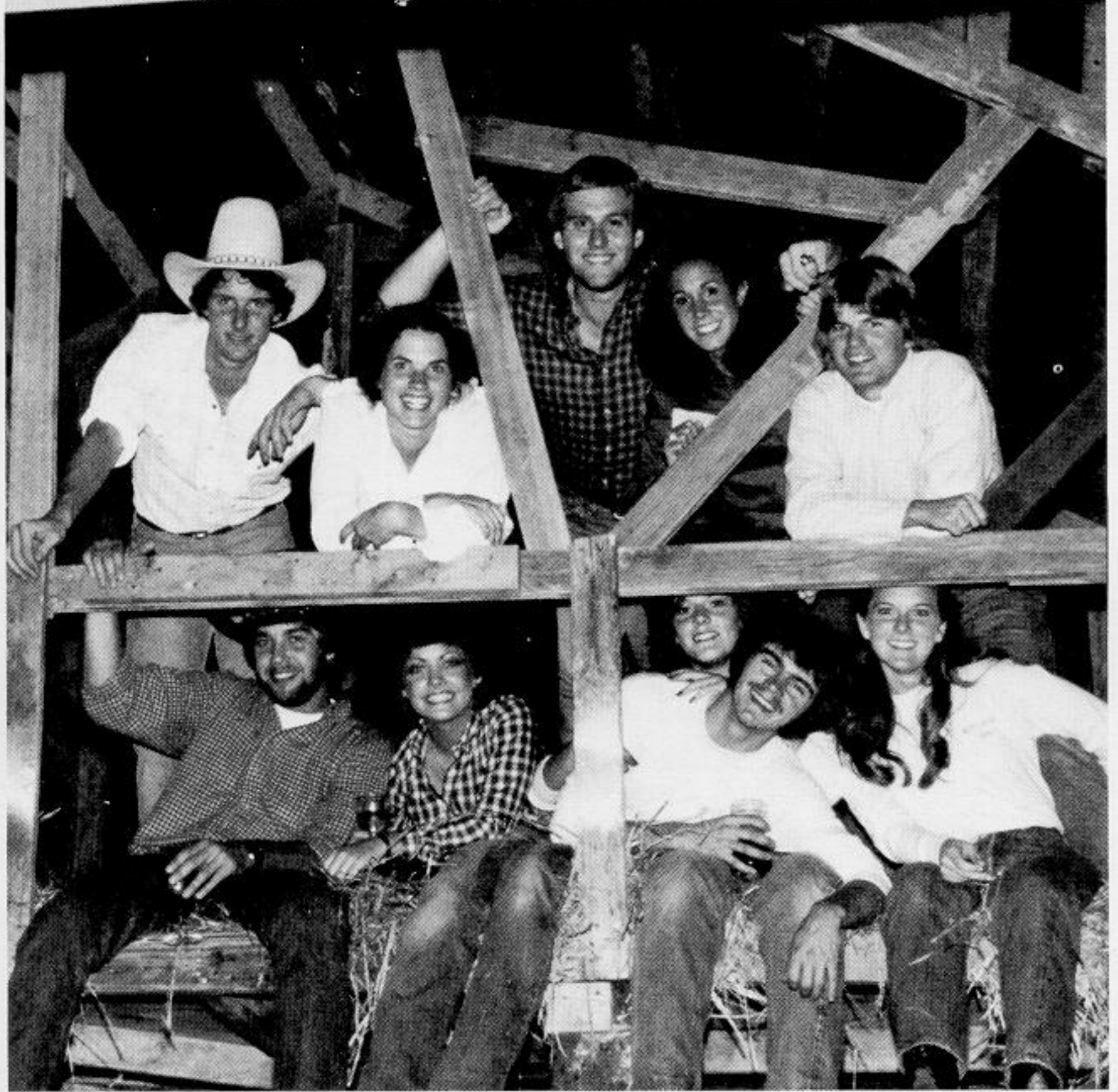
Hidden in the rafters are Betas and their dates at the Barn Dance.