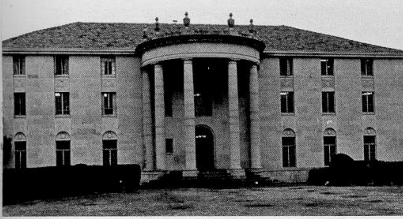
Beta Theta Pi fraternity house, 800 Chautauqua.