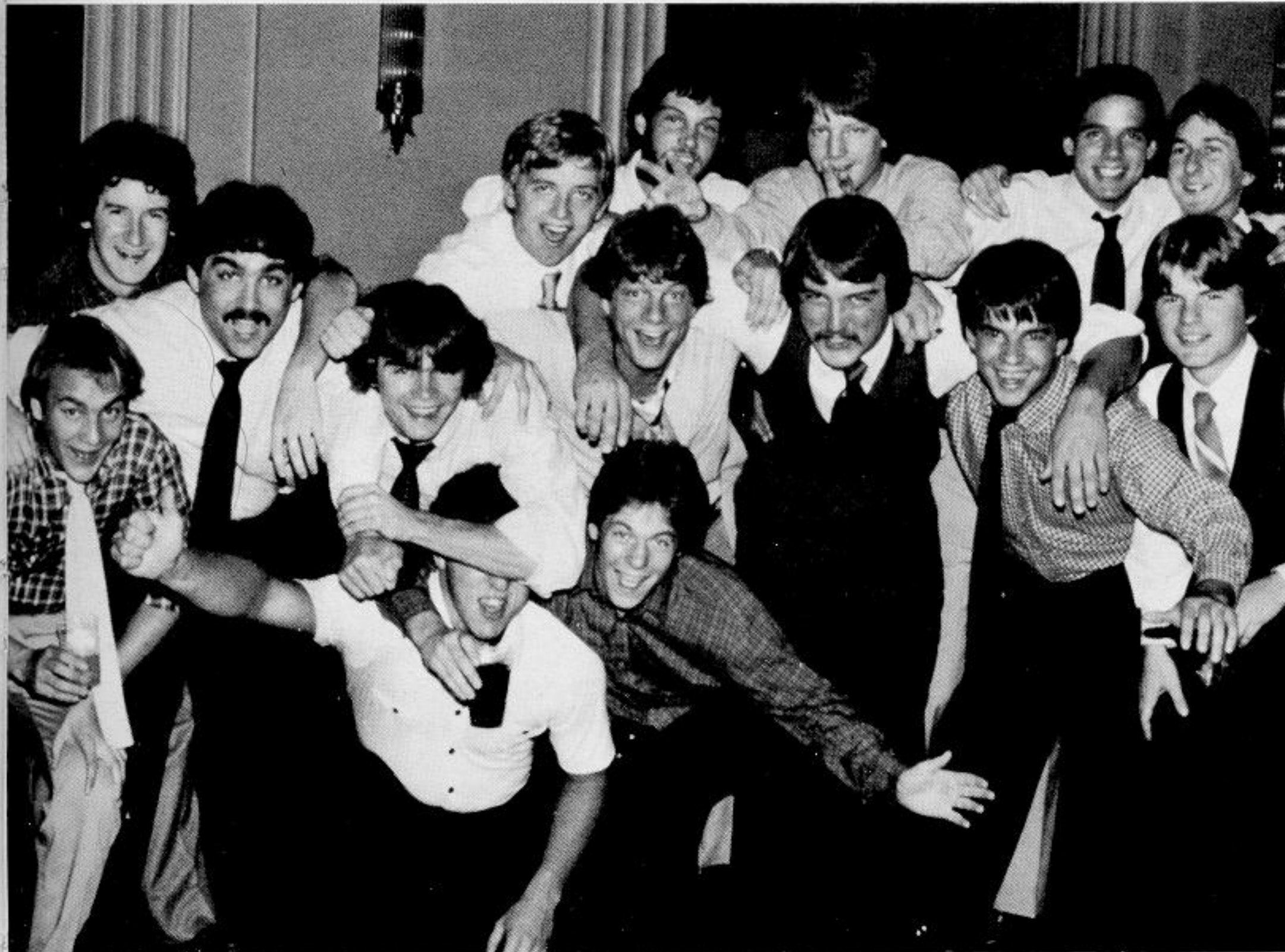
Beta men liven up the Gamma Phi Beta Christmas formal.

The quest for excellence in all areas of university life has been the foundation of the Gamma Phi chapter of Beta Theta Pi. This tradition continued through the 1980-81 school year: Betas were leaders in academics, student government, intramurals and other campus activities.