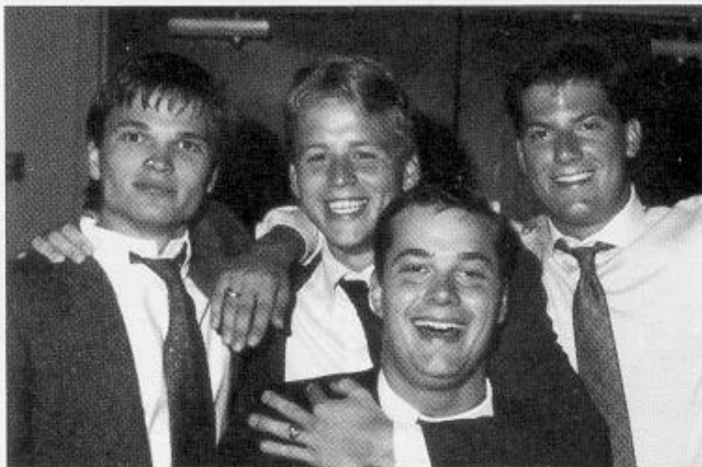
ON OCT. 14, Beta Theta Pi and Delta Tau Delta celebrated OU-Texas weekend.