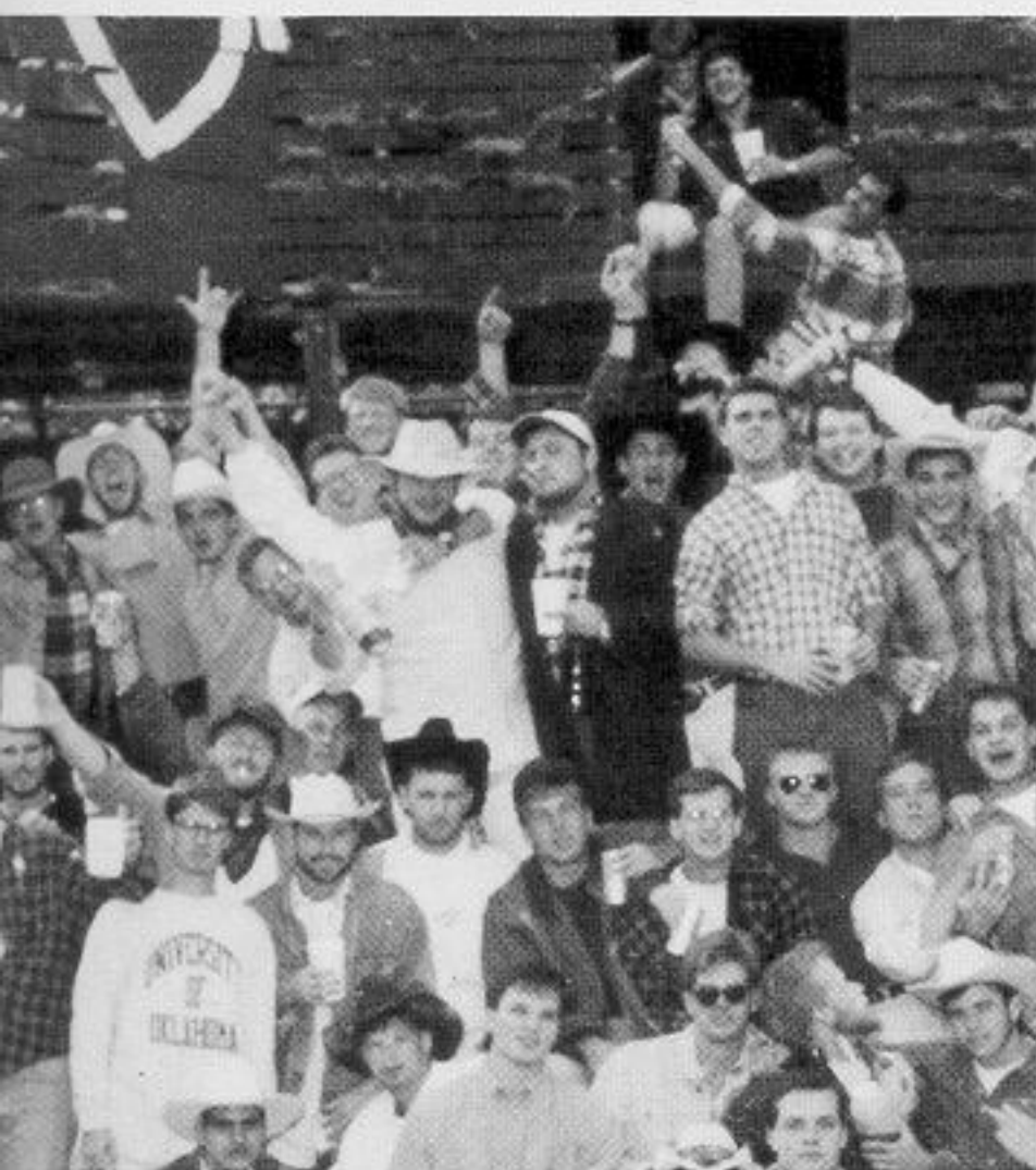
IN NOVEMBER, the annual "Barndance" was attended by not only members of the fraternity, but chickens, pigs and ducks, as well.